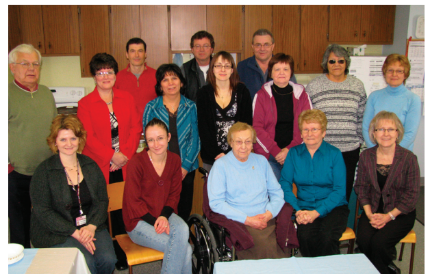
Community Working Group Members Rossburn, Manitoba

A Think Tank was held in Winnipeg in March 2009 to discuss future steps and receive final feedback on the model, tools and processes. The participants were asked to discuss in small groups the question ‘What broad actions would you want to see in place in order to facilitate achievement of the long term priorities identified by the communities?’ The broad actions to address the longer term priorities as identi-