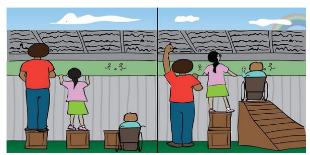
Figure 1: Equality vs. equity

Equity involves giving everyone what they need to be successful. Equality on the other hand, involves treating everyone the same. Equality also aims to promote fairness, but it can only work if everyone starts from the same place and needs the same help. The following image presents the difference between these two concepts.