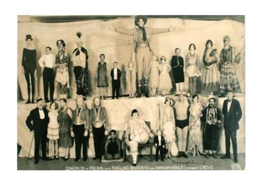
Racist colonial exhibition<sup>50</sup>